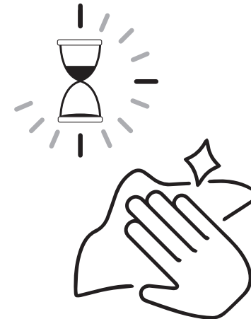
Address any spills immediately